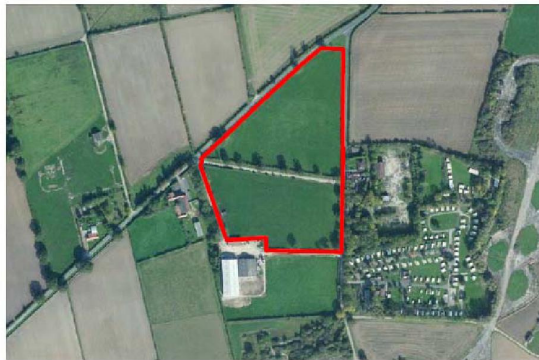
Aerial photograph with application site outlined in red

4.1 The application site is relatively flat and well screened from Common Lane (to the west) and Moorfields Lane (to the east) by mature trees and hedging, and has had an additional intensive tree belt planted around its entire periphery, which further screens the site. The site interior consists of two fields separated by a private concrete road, gated at either end and orientated east to west leading from Common Lane to Moorfields Lane.